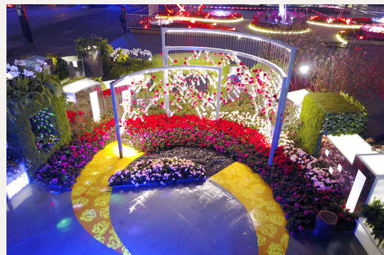
ArchSD's Landscape Display at Flower Show 2017