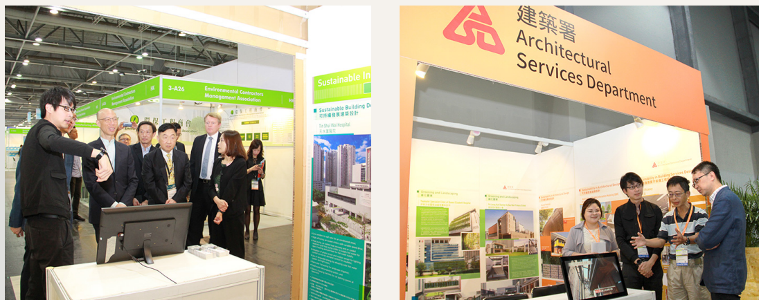
ArchSD Exhibition at Eco-expo 2017

Similar to last year, we took presence in the 12 th edition of Eco Expo Asia at October 2017, which was a four-day expo from 26 October to 29 October 2017 jointly organised by the Hong Kong Trade Development Council (HKTDC), Messe Frankfurt (HK) Ltd. and co-organised by the Environment Bureau. ArchSD set up a booth with the theme of “Sustainable Innovation” to display our latest solutions and achievement in green buildings and energy efficiency.