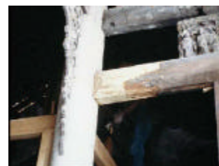
Replacement of deteriorated timber structure in Kun Ting Study Hall

The condition of the building before any intervention and all methods and materials used during treatment must be carefully documented. Any intervention must be the minimum necessary and reversible if technically possible. ‘The valid contributions of all periods to the building of a monument must be respected and unity of style is not the aim of conservation.’ 7 ‘Replacements of missing parts must integrate harmoniously with the whole, but the same time must be distinguishable from the original so that restoration does not falsify the artistic or historic evidence.’ 8