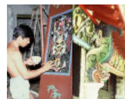
Paintworks on timber - Kun Ting Study Hall (Left), Tai Fu Tai (Right)

Repainting to timber carvings and eaves boards etc. were carried out based on the scraping of existing painting coats and old photographs. Extreme care was put on the retention of all the original wall paintings and Chinese calligraphy.