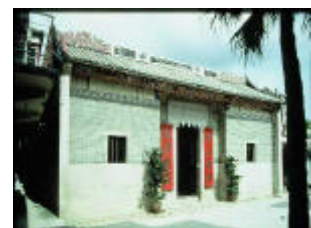
Front elevation of Kun Ting Study Hall, Ping Shan Heritage Trail

These principles have generally been adopted to serve as guidelines applying within the framework of the local culture and traditions. Conservation works at Tai Fu Tai and Kun Ting Study Hall are illustrative examples of the application of these principles.