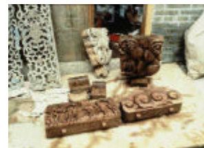
Salvaged timber components from roof structure of Kun Ting

As much as salvaged material was used in the conservation works to provide authenticity and the original method of construction was employed. Deteriorated greenish grey brickworks were carefully cut out and piece in with second hand bricks of matching size. Existing timber and door screens were repaired. Missing panels were put back on the traditional timber sockets complete with decorations traced from the existing historic building.