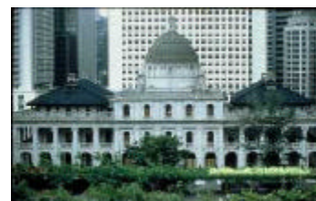
Legislative Council, Central, Hong Kong

The concept of an historic monument is defined to embrace ‘not only the single architectural work but also the urban or rural setting in which is found the evidence of a particular civilization, a significant development or an historic event.’ 5 The aim of conservation is to retain and safeguard the cultural significance of a place with unswerving respect of the existing fabric: the aesthetic, historical and physical integrity of the cultural property.