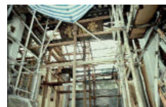
Temporary structural supporting and working platform falsework

During the course of the conservation works, the historic structures were firstly stabilized to prevent further collapse and deterioration. The historic integrity of the buildings was respected and decisions had to be made on which part of the